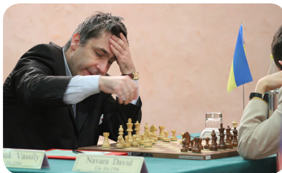
Ivanchuk already seems to despair, foreboding of his misdeeds in the match against Navara.